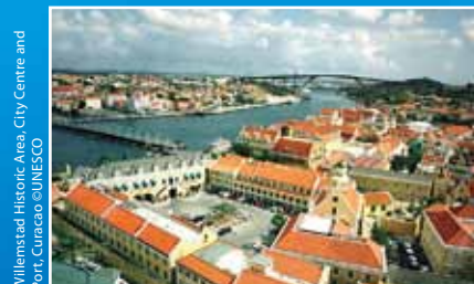
Willemstad Historic Area, City Centre and Port, Curaçao

The World Heritage Committee adds a fifth 'C' – Community – to its Strategic Objectives, highlighting the important role of local communities in preserving World Heritage.