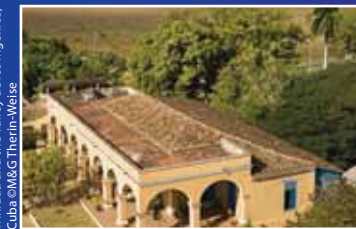
Trinidad and the Valley de los Ingenios, Cuba

With 377 sites inscribed in the first twenty years of the Convention, the World Heritage Centre is established to oversee the day-to-day management of the Convention. A new category of sites is added, making the Convention the first legal instrument to recognize and protect cultural landscapes .