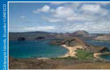
Galápagos Islands, Ecuador

The World Heritage Committee develops selection criteria for inscribing properties on the World Heritage List, and draws up Operational Guidelines for the Implementation of the World Heritage Convention , setting out among other principles those of monitoring and reporting for properties on the List. Ecuador's Galápagos Islands becomes the first of twelve sites to be inscribed on the World Heritage List.