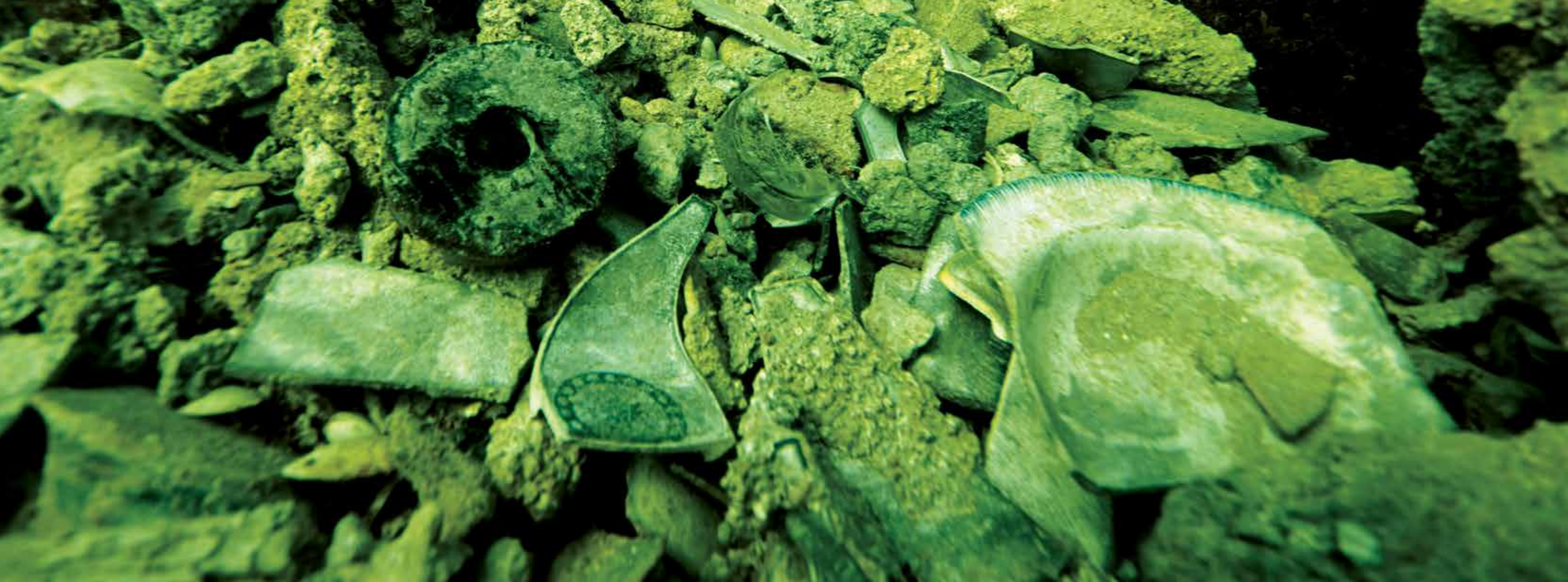
El Navegador, Cuba

Referring to the discussions and suggestions during the workshop, the participants propose to the States and governmental and non-governmental organizations as a priority action plan the following recommendations: